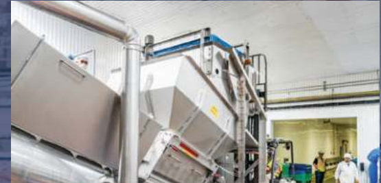
Custom Metal Design