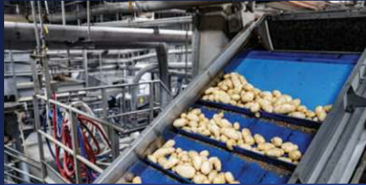
Raw Product Conveyors