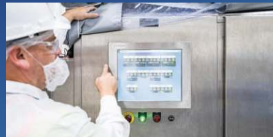
Integrated Control Systems