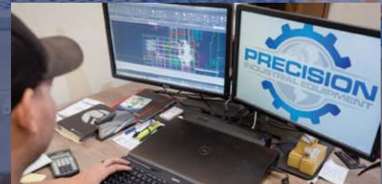
Design & Drafting