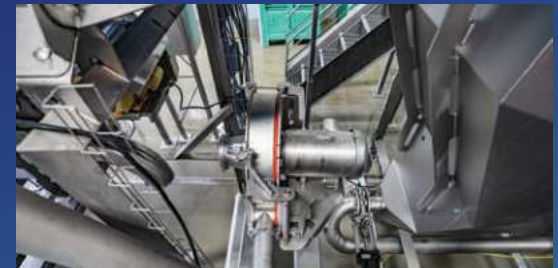
Negative Air Systems